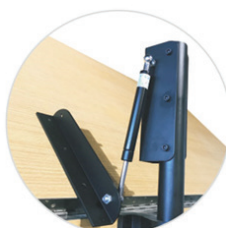
Top adjustable air pressure