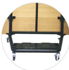
Weighted base / silent pulley